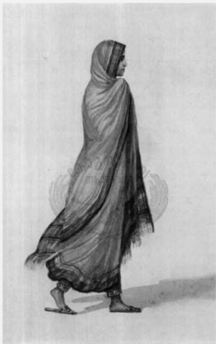
MEMAN LADY WALKING